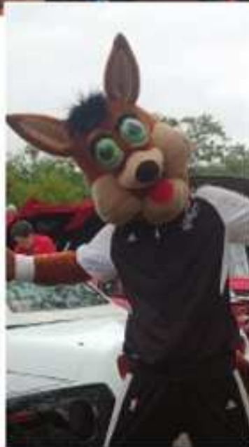
TOP: Numerous Corvettes turned out April 18, 2009 for the TCA Annual Open Car Show held in Boerne, Texas.

This year's show will go down in the memory books. Show officials had been watching the weather all week and knew it was going to be a nail-biter. Conversations just two days out included words like 'reschedule,' 'back-up site' and 'rain date.' When they awoke the morning of the show to rain, they remained optimistic. By 9 am, the sun was out, and things were beginning to dry out. Despite the weather, there were more than 200 cars that showed, including over 80 whose owners drove in, despite the rain and registered that morning! Thousands more turned out to see everything, and the funds raised were the highest to date. In a ceremony on June 2, 2009, a check for $90,000 was presented to St. Jude's Ranch for Children, thanks to some of the most incredible, giving, generous and sincerely kind Corvette enthusiasts you will ever meet. Please join them next year on Saturday, April 17, 2010.